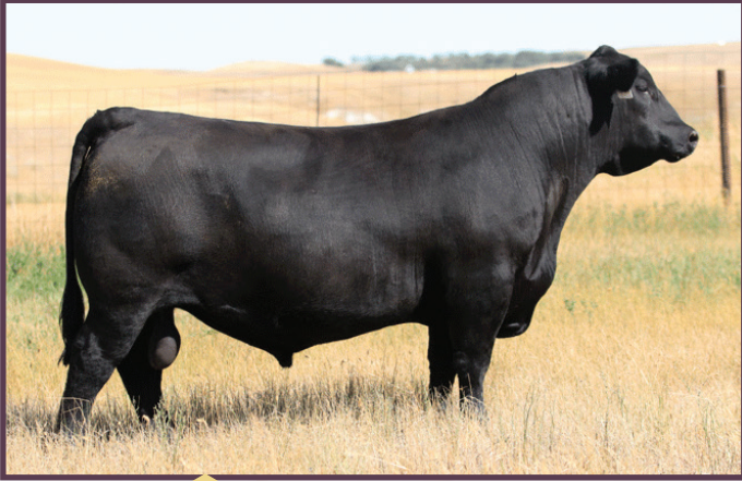
IT GALLEON 1229