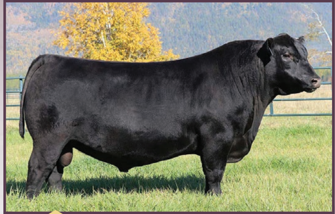
MONTANA JUDGEMENT 1038