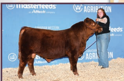
NAVAJO 6N AT AGRIBITION 2025