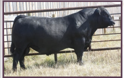
HNB 8M - MATERNAL BROTHER