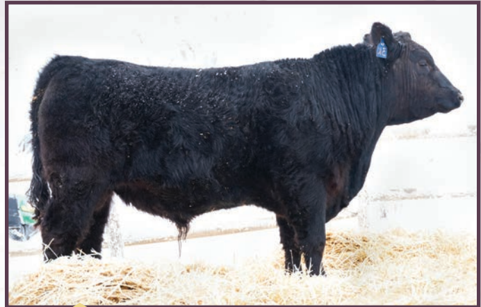
HONEYBROOK SKY FALL 3K