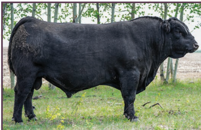
HONEYBROOK SOUTHERN COMFORT 7K