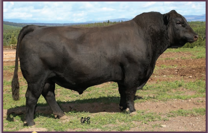
BAR-E-L NATURAL LAW 52Y