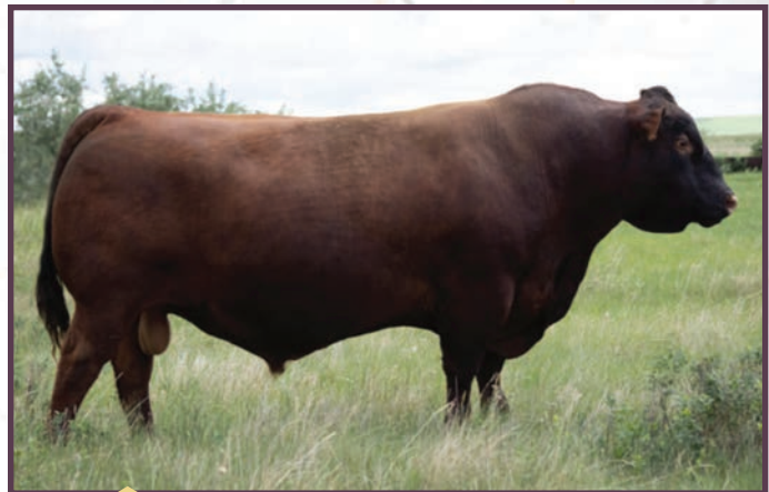
RED WILBAR ELEMENT 220E