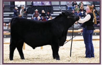
CHURCHILL 13N AT AGRIBITION 2025